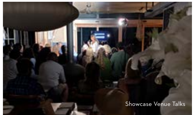
Showcase Venue Talks