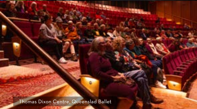
Thomas Dixon Centre, Queensland Ballet