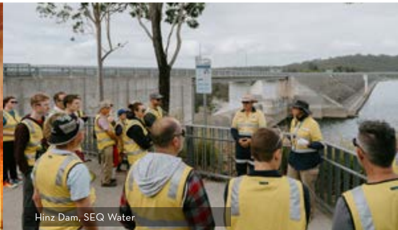
Hinze Dam, SEQ Water