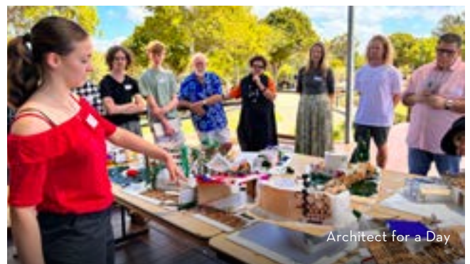
Architect for a Day