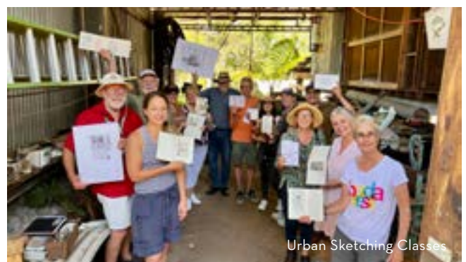
Urban Sketching Classes