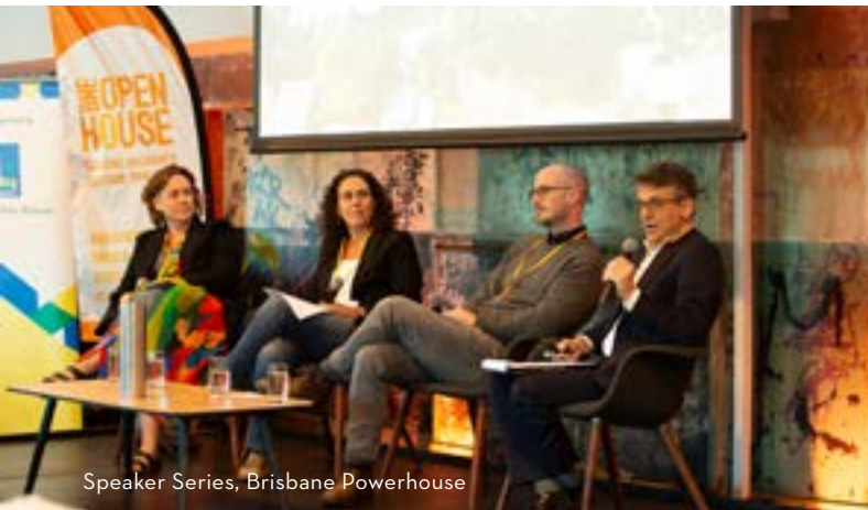
Speaker Series, Brisbane Powerhouse