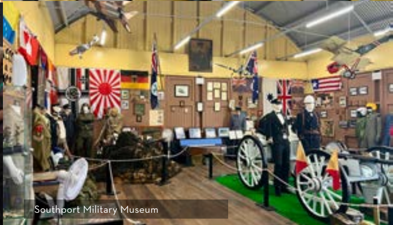
Southport Military Museum