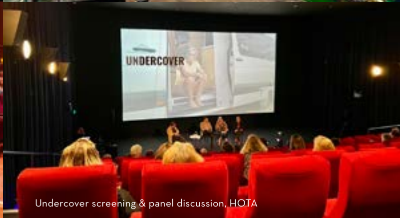
Undercover screening & panel discussion, HOTA