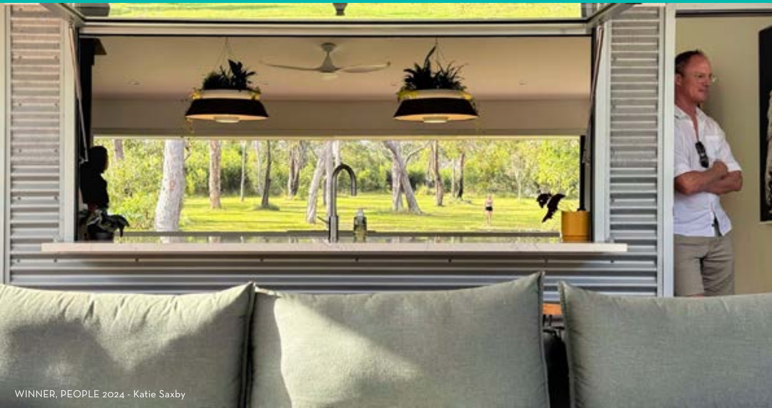
WINNER, PEOPLE 2024 - Katie Saxby

Sunshine Coast Open House is a high-profile, community and industry-focused event that showcases design, architecture, building design, interiors, heritage and gardens. With significant community interest, building tours book out quickly each year. Everybody loves Sunshine Coast Open House!